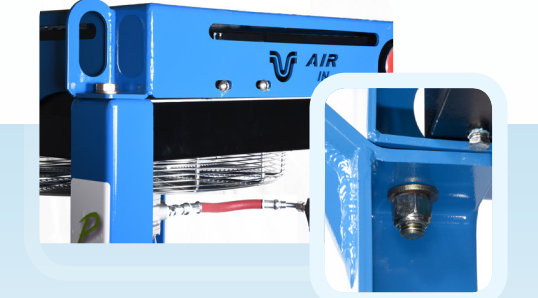
F200 Exhaust Filter with muffler